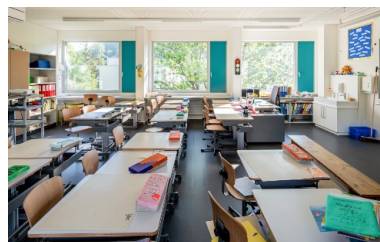
The spacious classrooms in the ZM10 school pavilion get plenty of daylight thanks to the large windows.