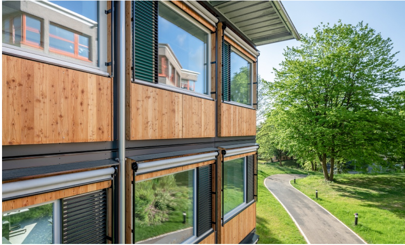
Timber facade of the modular school pavilion