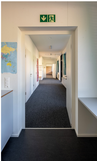
School hallway in the ZM10 pavilion