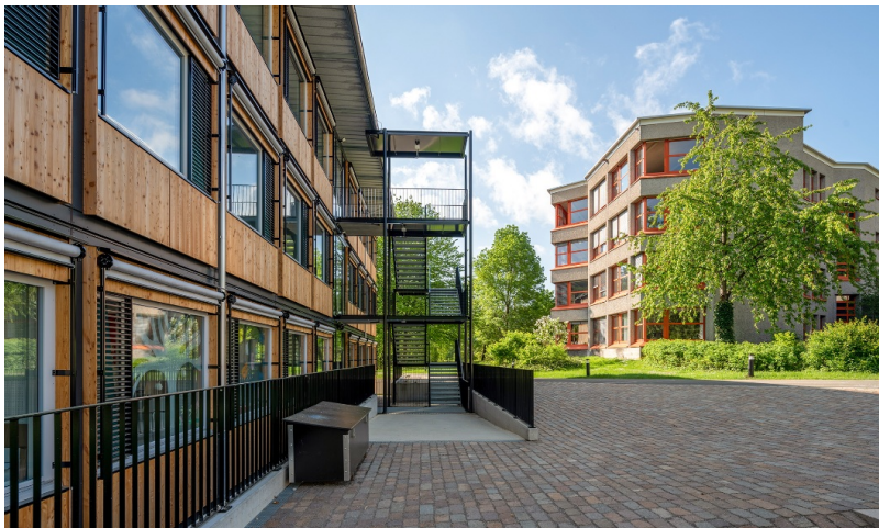
The school pavilion's different levels are accessed via an external staircase.