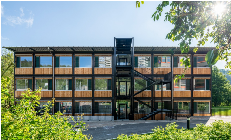
Three-storey Züri-Modular - the temporary pavilion at the Sihlweid school in Zurich.