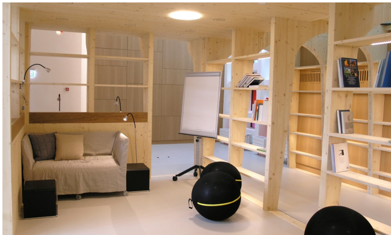
A quiet corner for individual study