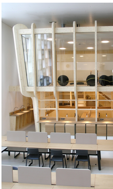
Classroom with different workstations