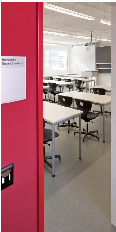
View of a classroom