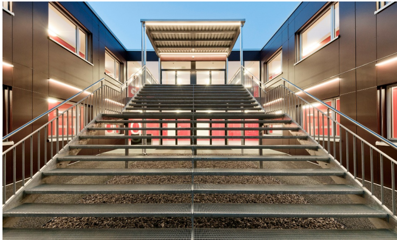
Staircase, temporary building, Baden cantonal school