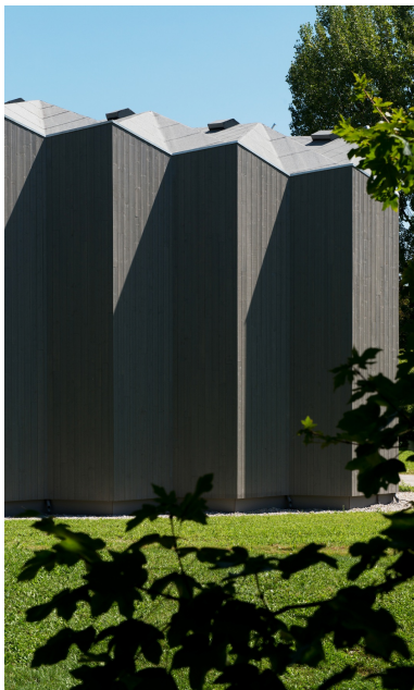
Folded plate-style support structure