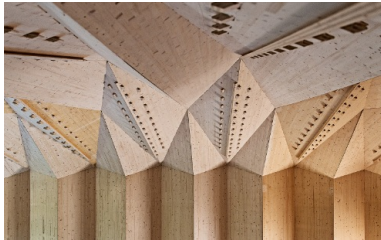
Interior view of the seating at Théâtre de Vidy