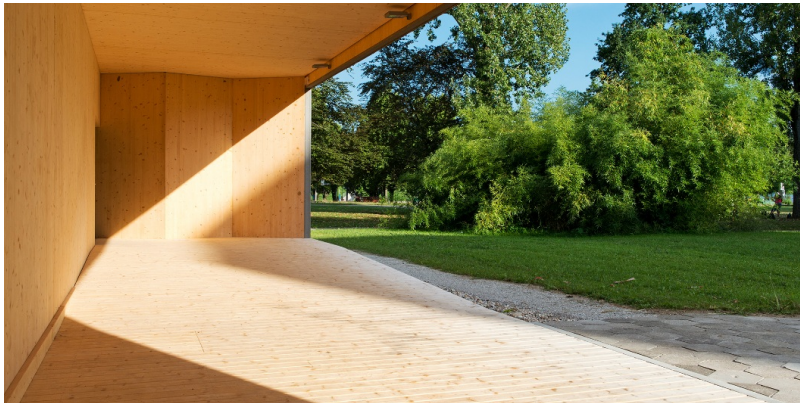
Reception area, Théâtre de Vidy