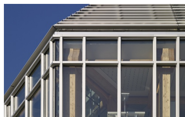
Open-plan reception area