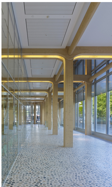
Exposed support structure inside the building