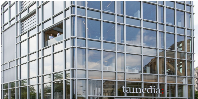
7-storey office building