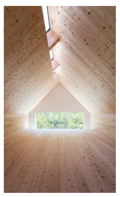
A meditative space: the top floor is infused with a regenerating temperature and air quality thanks to an interior finished entirely in Swiss pine.