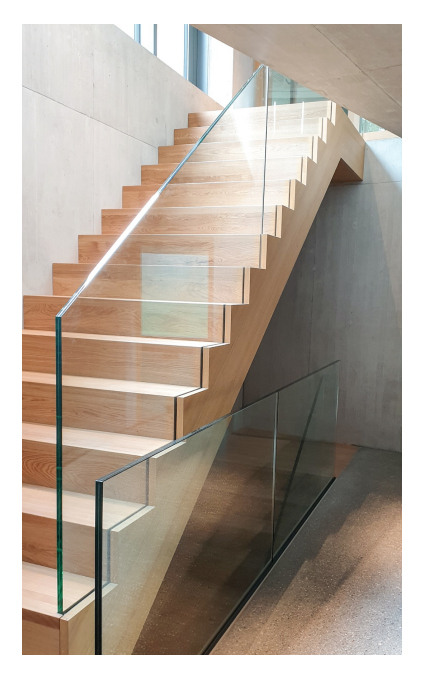
The wooden staircase offsets the cool, restrained design with its extensive concrete and glass and has a warm and invigorating effect.