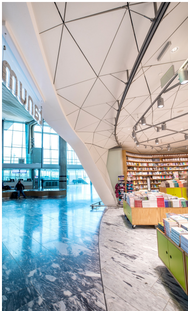
Close-up of clad timber construction