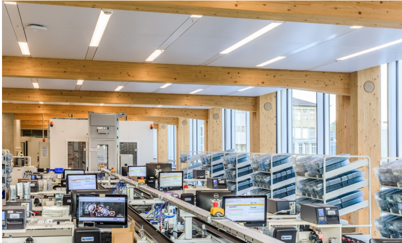
Modern production facilities