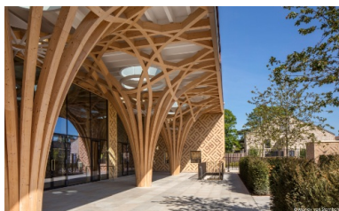
Entrance to the mosque