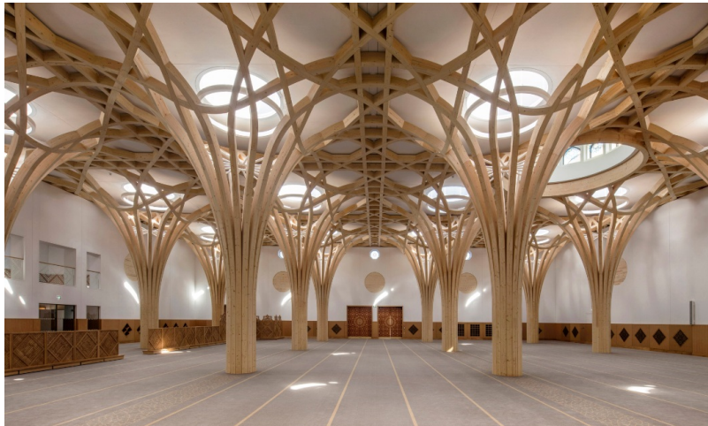
Prayer hall with free-form supporting structure