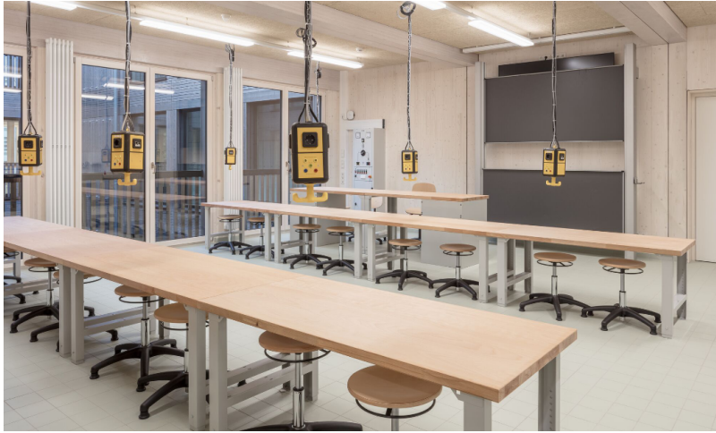
Workroom of the Schilfweg School Dresden