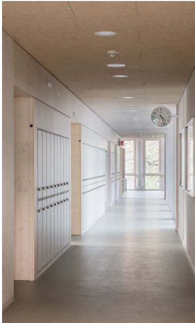
The 112 room modules in total were produced in our factory in Grossenlöder.