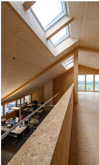
Generous office space