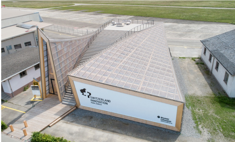
Lighthouse project for the Innovation Park