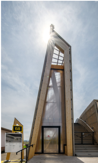
Entrance area in the free-form shell