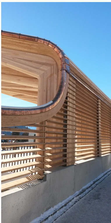
Tribune facing the road