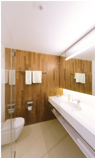
Bathroom module design