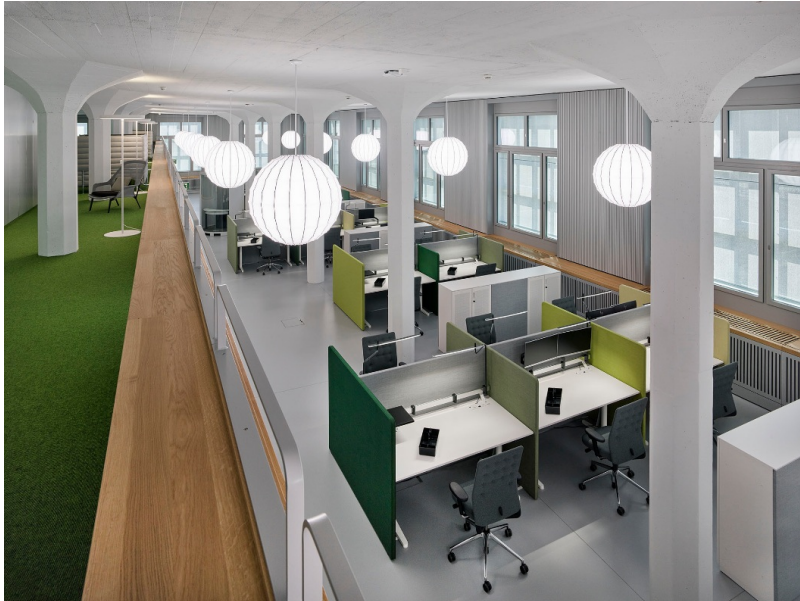
View of the gallery inside the modern office spaces