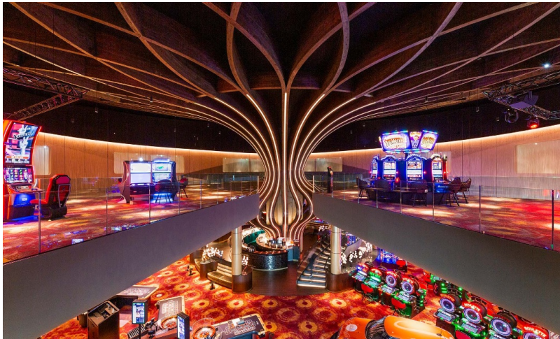
The free form column is the centrepiece of the atrium.