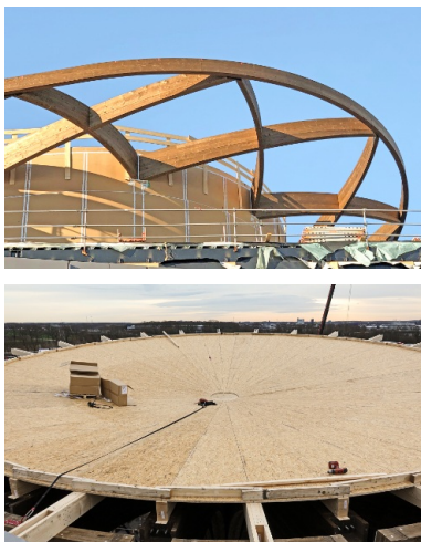
Detailed view of the roof construction during construction work