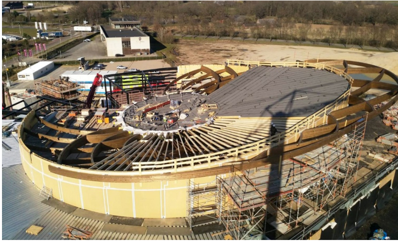
The timber construction takes shape. Bird's eye view of the construction site.