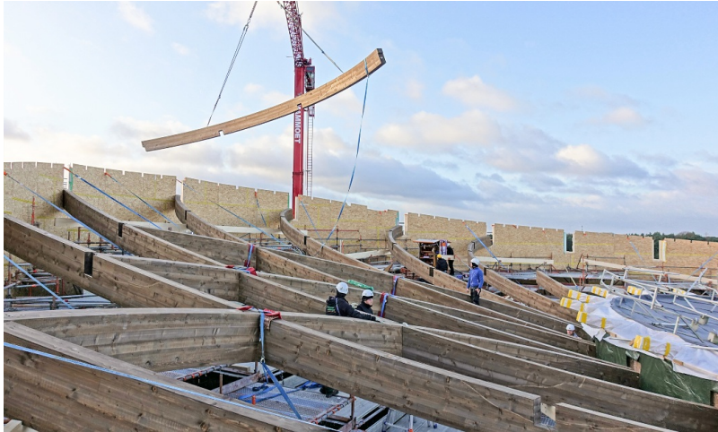
Construction work on the supporting structure.