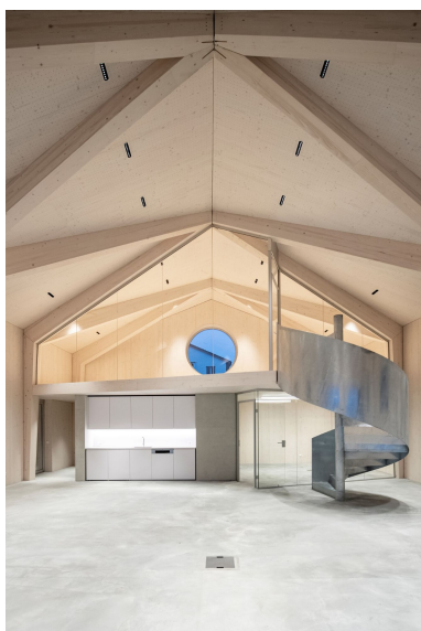
Office space with room for 16 workstations as well as meeting rooms and workshop spaces, a kitchen, common area and storage.