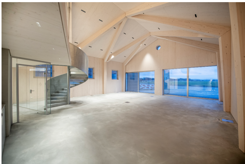
Office space with view of a former airfield runway.