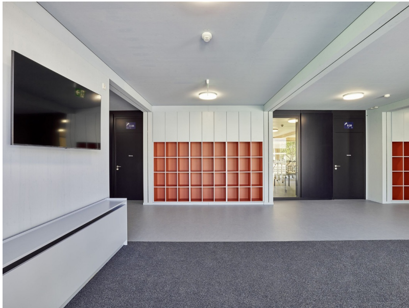
Invitingly designed entrance area with info screen