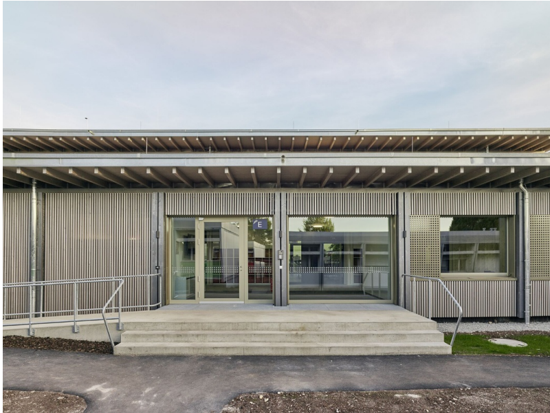
Barrier-free school entrance