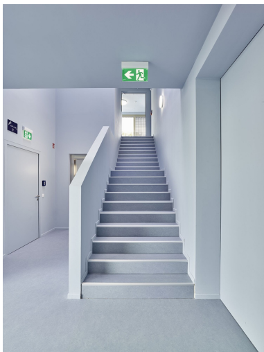
Simple and functional staircase in the two-storey modular school building.