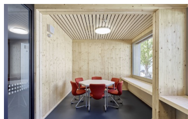
The extension to the Fuchshof School even has its own dining room with kitchen.