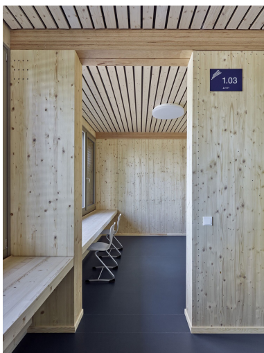
A lot of visible wood in the interior fittings ensures a pleasant indoor climate.