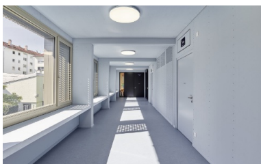
Spacious school hallway with bright windowsill to linger.