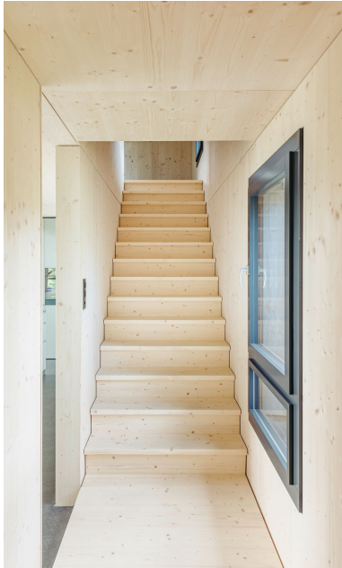
Staircase, walls, roof and floor – all made from spruce.