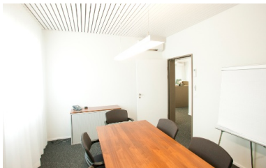
Provisional meeting room

info@blumer-lehmann.com blumer-lehmann.com