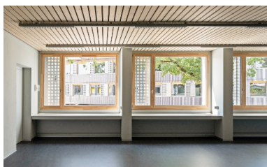
Large windows let lots of natural light into the classrooms.