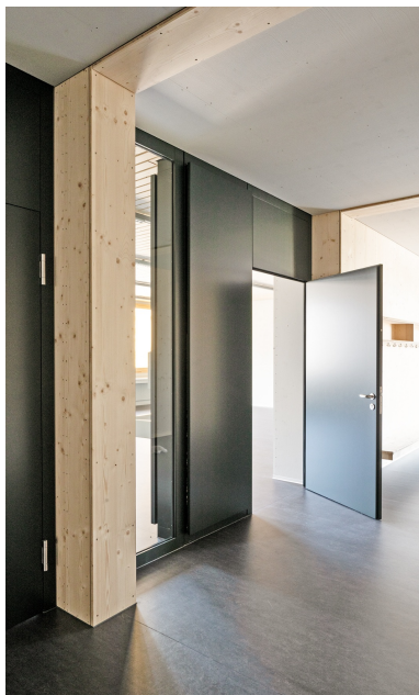
Entrance area to the school pavilion in high-quality timber design built to Minergie Eco standard