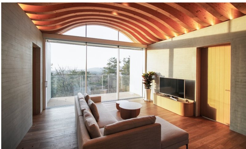
View inside a suite in the Timber House, Condo A