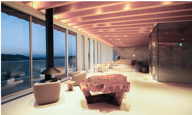
The distinctive timber beams on the ceiling create a pleasant atmosphere in the Recreation Centre's lounge.