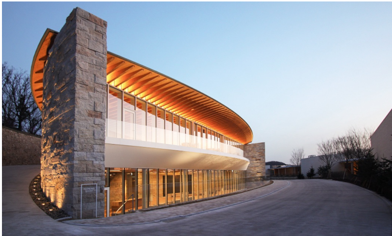
Haesley Nine Bridges Golf Club, Learning Centre at night