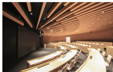
Simple, functional interior design in a classroom in the Learning Centre