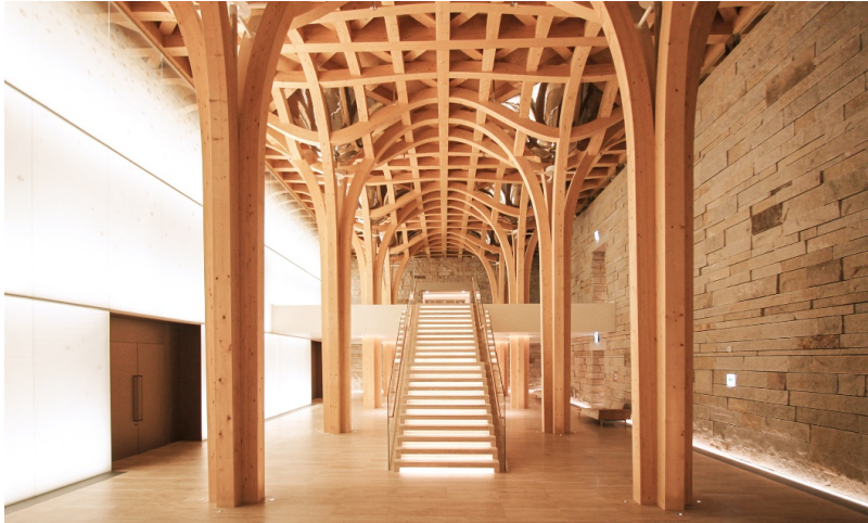
Stairs in the Learning Centre