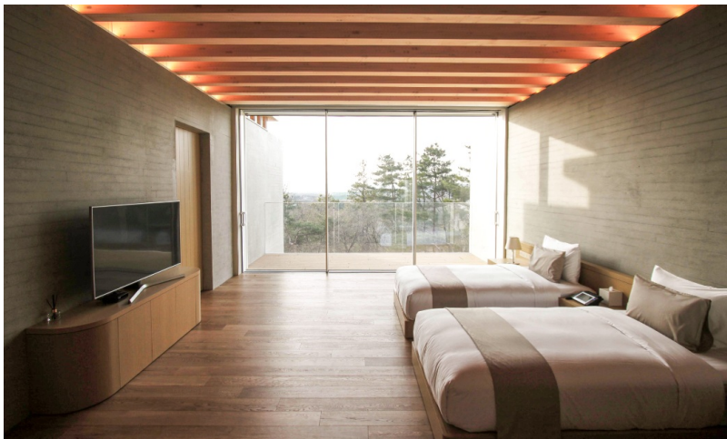
View inside a two-bed bedroom in the Timber House, Condo A