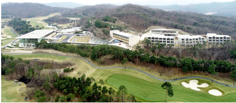
Bird's eye view of all buildings