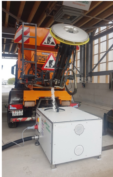
Modular silo facility for gritting materials in Fribourg