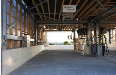
Mobile salt conveyor system for salt residues in the gritting vehicle