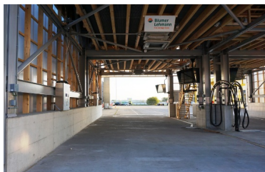
Mobile salt conveyor system for salt residues in the gritting vehicle