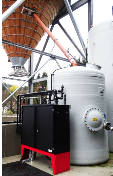
Runder Silo aus Holz auf einem kubischen und feuerverzinkten Stahlfunderbau